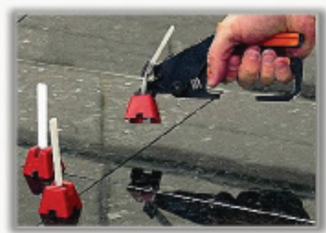
Strap T1 and Base B1

6) once the adhesive has cured ( see the adhesive manufacturer technical data sheet) it is possible to break the strap and remove the base. Insert the tail of the strap in the installation tool and pull until the tail breaks and frees up the base. Reuse it on next installations. On rough or hard glaze surfaces you may beat the base with a rubber mallet towards the grout line until it separates from the strap. (note: this action may damage the base and preclude future usage)